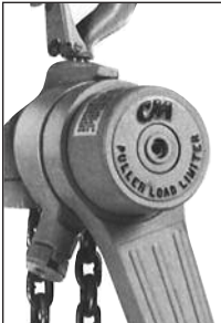
Optional Load Limiter